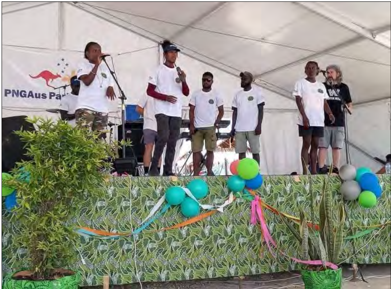
Figure 1. Youths participating at the Bougainville Voice X-plosion Program - 2023

Special acknowledgement is also extended to UNFPA and DFAT, for starting the policy process and setting the pathway through which the objectives of the review process of the policy was fully realized. Their ongoing partnership with the ABG DCD is expected to further contribute towards the implementation of this policy.