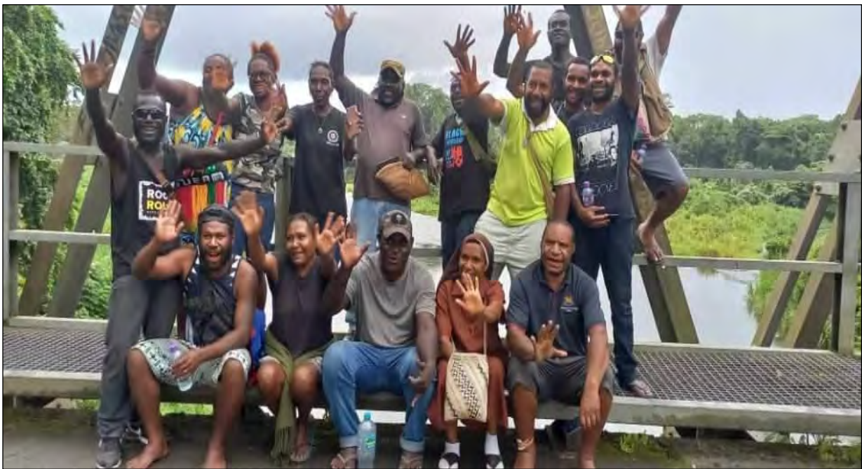
Figure 2. Youth Knowledge Exchange Program – Field Trip (Buin District)

The Mission of the Bougainville Youth Development Policy is: “to create an environment that will ensure that young men and women in Bougainville grow up to be empowered, educated, self-reliant, and prosper in contributing towards nation building objectives with a sense of belonging and worth, and are enabled to participate fully in the social, cultural and economic development of Bougainville.”